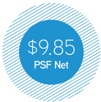
Asking Lease Rate